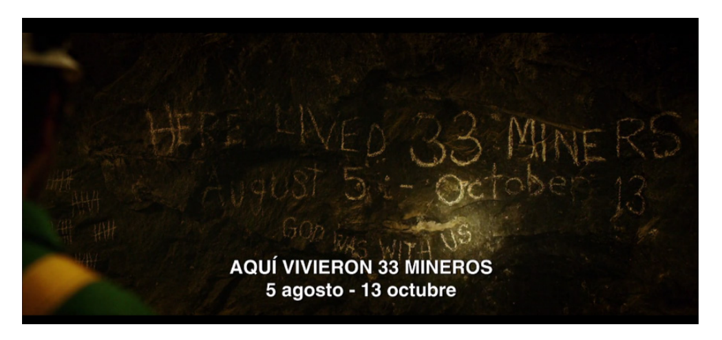
Fig. 5. Graffiti on the cave wall in the film The 33.