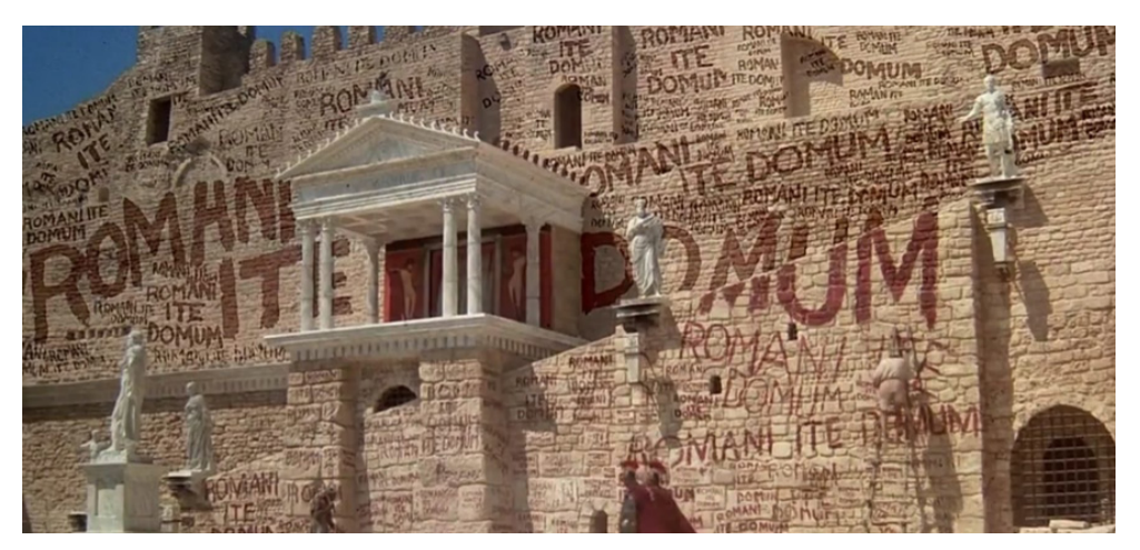
Fig. 1. Monty Python's Life of Brian (1979).

Terry Jones' Monty Python's Life of Brian (1979) is perhaps one of the most singular cases of graffiti deliberately employed in films. At 26 minutes into the film, the iconic sentence "Romani ite domum" (Romans go home)," appears written on a wall.