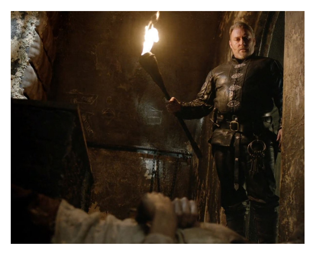
Fig. 4: A scene from Da Vinci's Demons, where historical graffiti is shown on the wall.

Lastly, Patricia Riggen's The 33 (2015), about the miners trapped 700m underground for over two months after the collapse of the San José mine. In one of the final scenes of the file, graffiti is prominent on the wall of cave in which they were trapped. It states: "Here lived 33 miners, August 5 – October 13. God was with us."