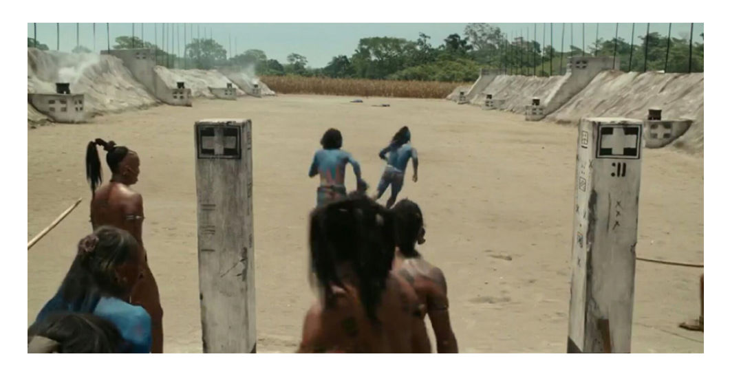
Fig. 3: A scene from Apocalypto, where graffiti appears next to hieroglyphs on columns.

Hieroglyphs in Yucatec Mayan appear in Mel Gibson's Apocalypto (2006). A linguistic analysis shows that these are numbers, with one represented by a point, and five represented with a line. The sum of these characters would show us the numbers "11, 16 and 6" written on the left column (see Fig. 3 below).